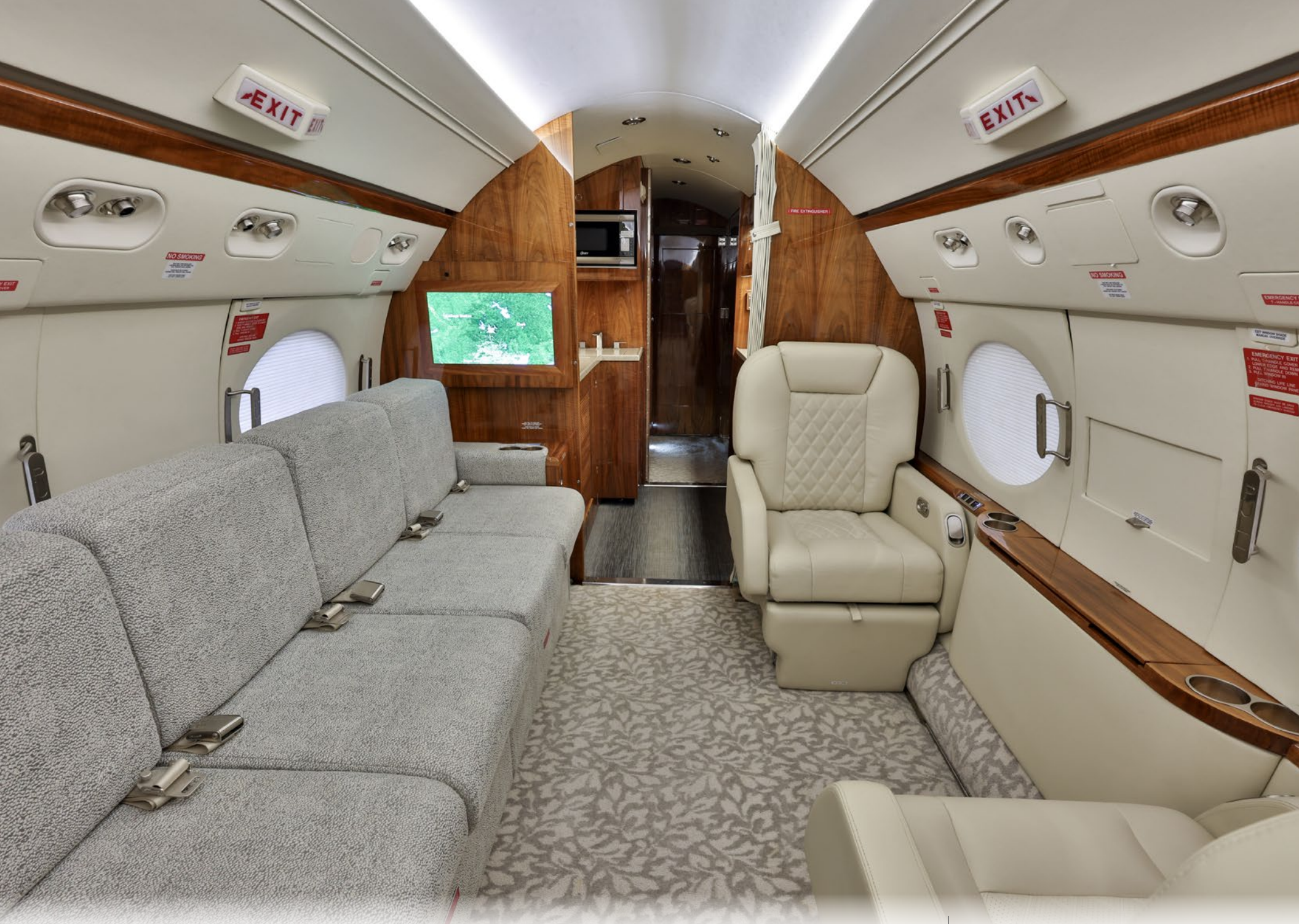
1996 GULFSTREAM GIVSP SERIAL NUMBER 1302

WWW.OGARAJETS.COM +1 770 955 3554 | inquiry@ogarajets.com