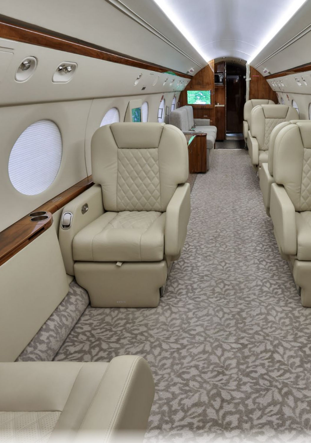
1996 GULFSTREAM GIVSP SERIAL NUMBER 1302