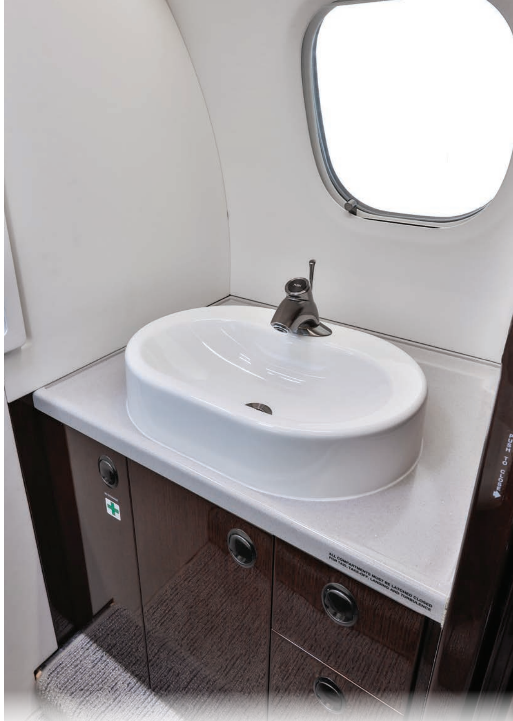
WWW.OGARAJETS.COM +1 770 955 3554 | inquiry@ogarajets.com