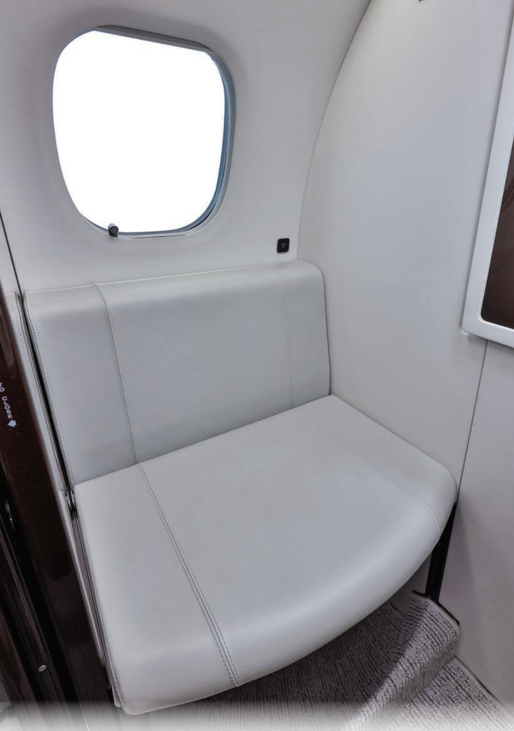
2022 PHENOM 300E SERIAL NUMBER 50500718