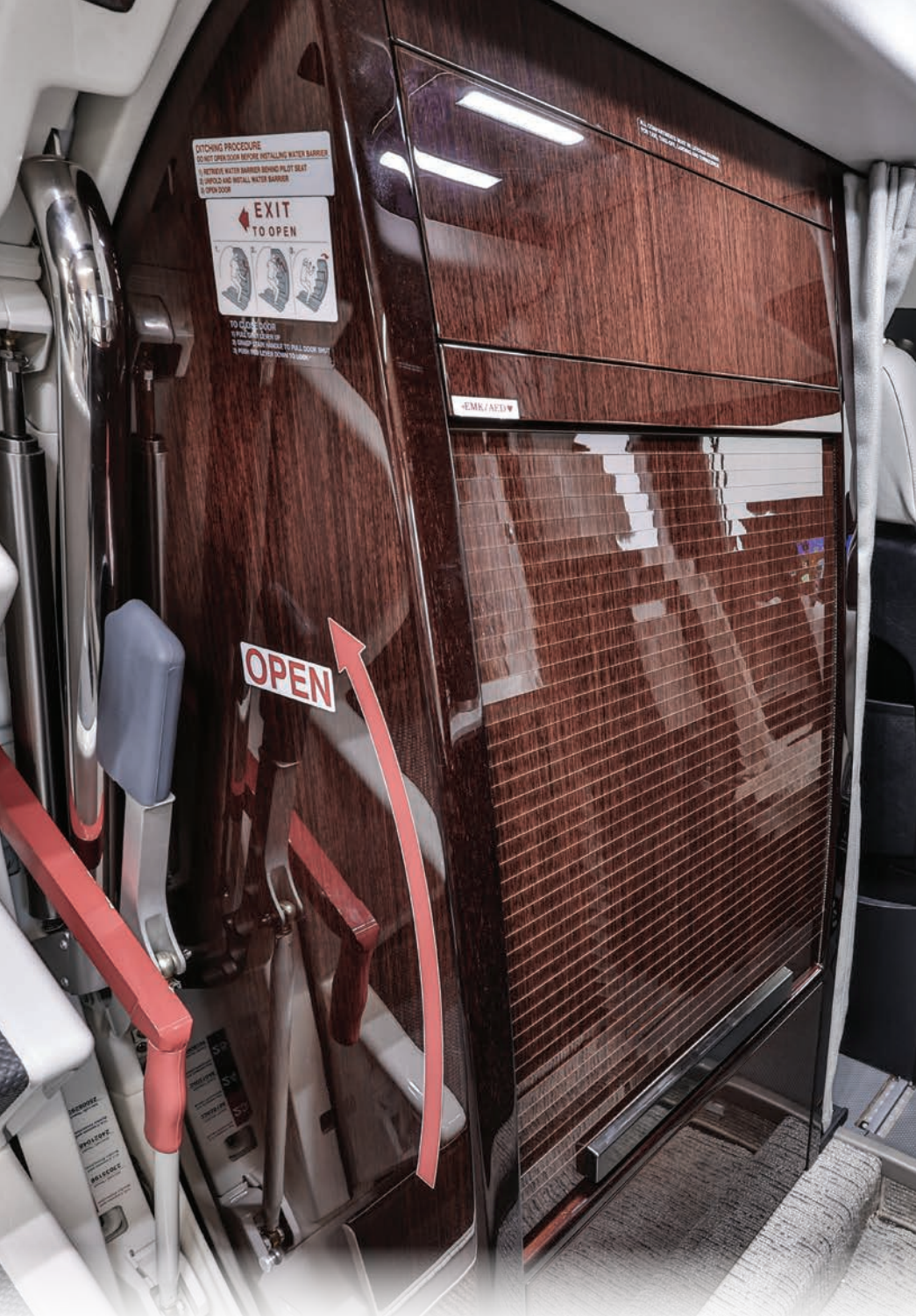
2022 PHENOM 300E SERIAL NUMBER 50500718