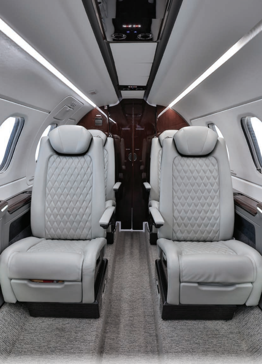
2022 PHENOM 300E SERIAL NUMBER 50500718